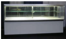
HALF VISION CASE